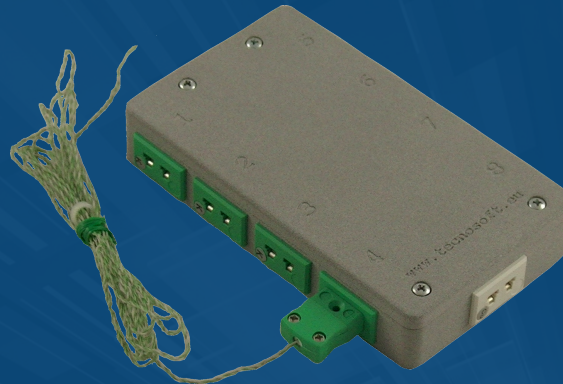
TC - Log 8